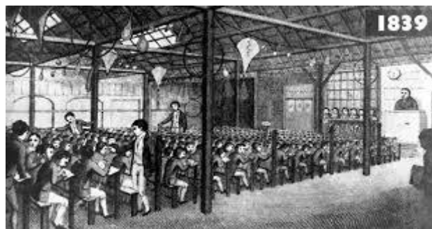
Figure 4: A monitorial schoolroom, Lancasterian, 1839 (English image)

The second broad approach of importance in the early nineteenth century was monitorialism. It was a deliberate pedagogic innovation. Two versions of it came to the Australian colonies from England. One was invented by Andrew Bell, though he acknowledged Indian influences. It was especially taken up by colonial schools either operated by or within which the the Church of England was powerful. The other version was formulated by Joseph Lancaster, a Quaker. His monitorial plan was influential among dissenters from the Church of England, including Wesleyans (Methodists).