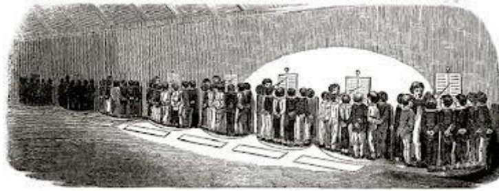
Figure 5: Monitors with groups at 'teaching stations'

There was a primitive psychology embedded in this form of instruction. A set of rewards for work well done was applied. These could include tickets, books and pictures.