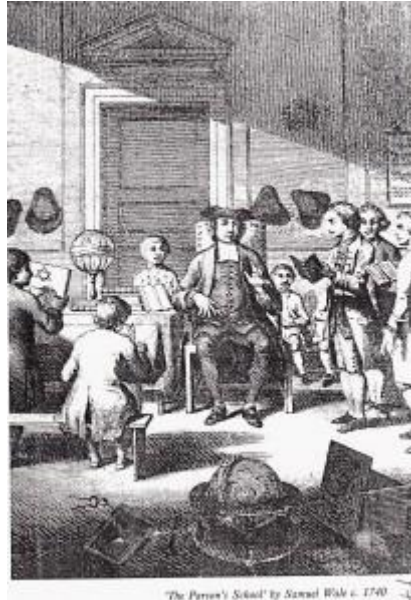
Figure 1: Individual teaching for the children of the middling and upper classes (English image)

Children and youth were often engaged individually, with different learning tasks. Figure 1 is an English representation of the individual method at work. In this case, as often occurred in early colonial Australia, a local clergyman for example could supplement his income by taking students. In this case the work appears to be post-elementary.