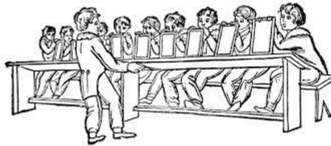
Figure 6: Work displayed for monitor's inspection. From Manual of the British and Foreign School Society, London, 1831.

Because this was a form of schooling that could involve very large numbers of young people in a confined space, the orderly control of movement was of paramount concern. Whistles, bells, flags and hand signals were among the apparatus used to control the movement of children. Clear instructions concerning the child's body were expected to be observed. How children's work on slates was to be displayed for checking by monitors was part of this (Figure 6) as was how children were to stand and sit at their desks (Figure 7).