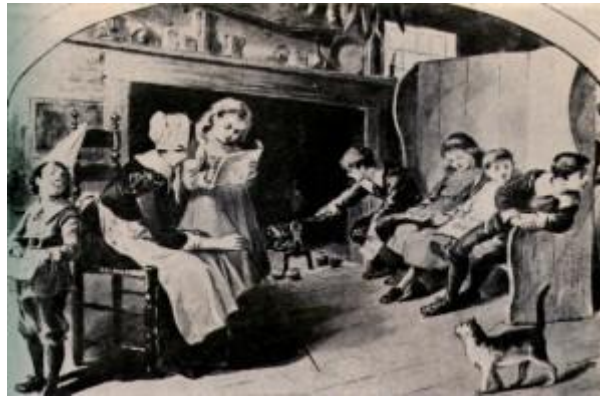
Figure 2: Dame and cottage schooling (North American image)

about how inefficient and disorganised they were. The reports told some truths, but they often hid the reason why they were attractive to the families that patronised them.